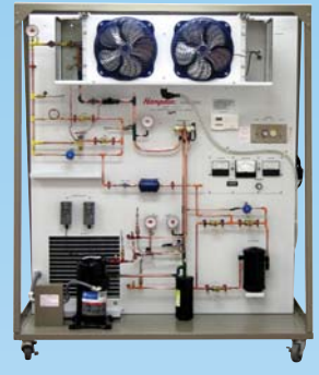
H-ACT-1 Air Conditioning System Trainer

The Hampden Model H-RST-2 was designed to provide students with an actual working model of a refrigeration system, complete in every detail. The Hampden Model H-RST-2 Mobile Refrigeration System Trainer helps students to develop a thorough understanding of the refrigeration cycle. It can operate in five different modes, allowing testing & troubleshooting experience for various types of refrigeration systems.