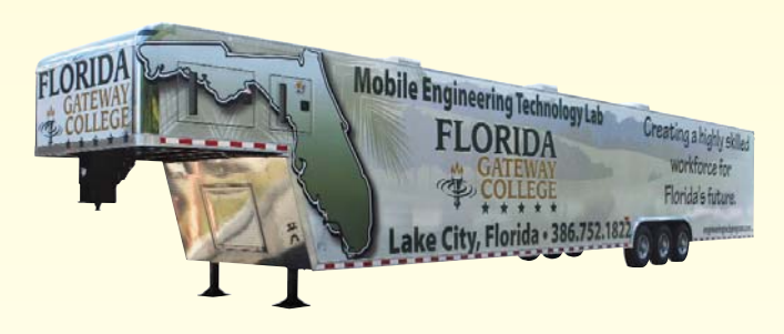
Two entry doors, back loading door, and two side mounted awning doors