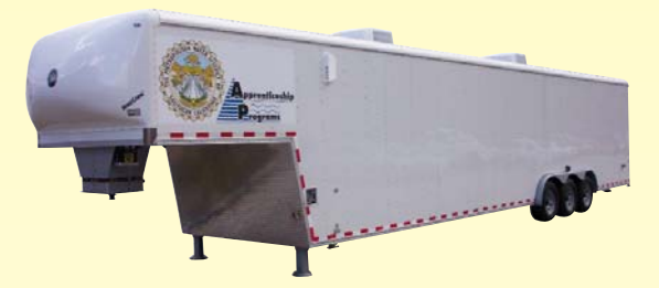
Two entry doors, back loading door, and two side mounted awning doors