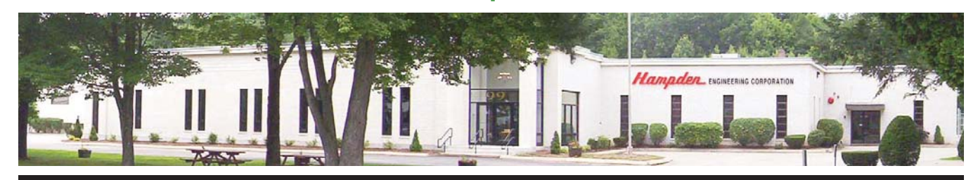
Hampden is committed to providing industry-leading technology.

Consists of workbenches mounted inside trailer to provide a work space for Hampden Table Top trainers.