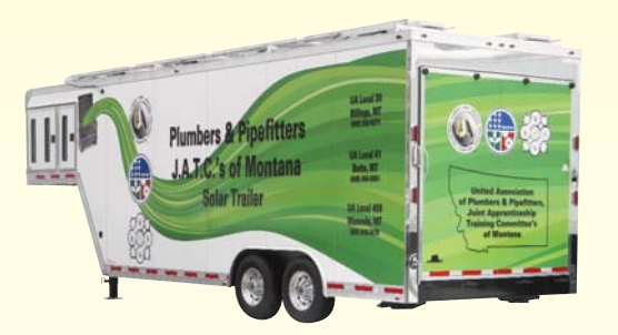
Two entry doors, back loading door, and one side mounted awning door, and solar mounted roof panels

Two entry doors, back loading door, and one side mounted awning door