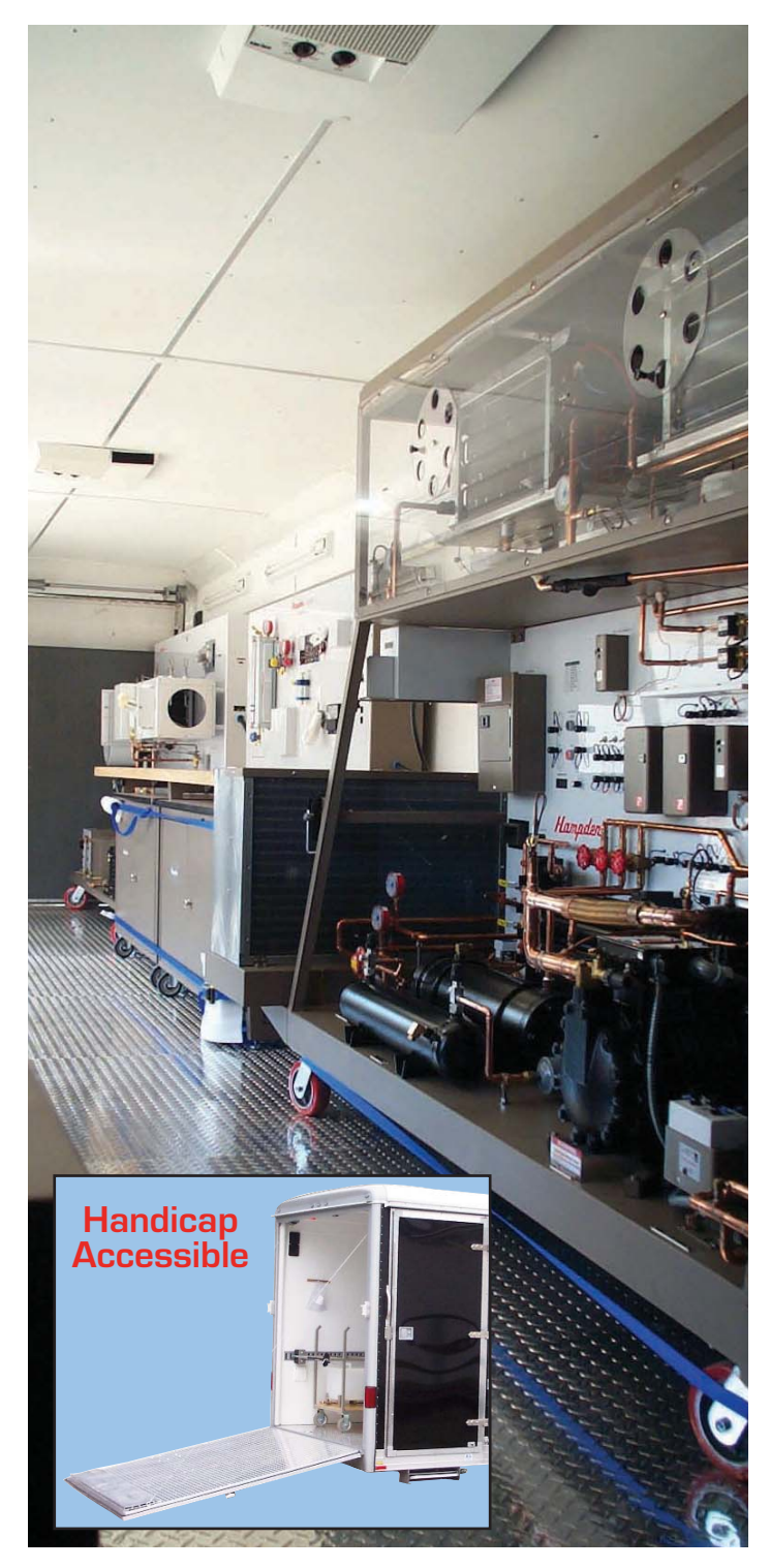
An inside look at one of Hampden's Mobile Classroom Trainers