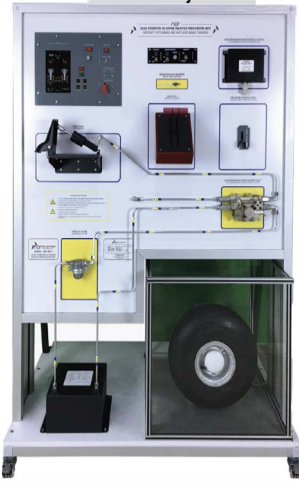
SKT-100B One Wheel Anti-Skid and Auto Brake System Trainer