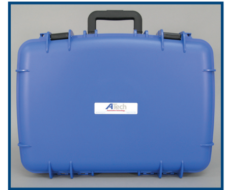
Includes: Clear Case Relay & Socket 500-008-006

The Electromechanical Trainer contains the following components and capabilities: